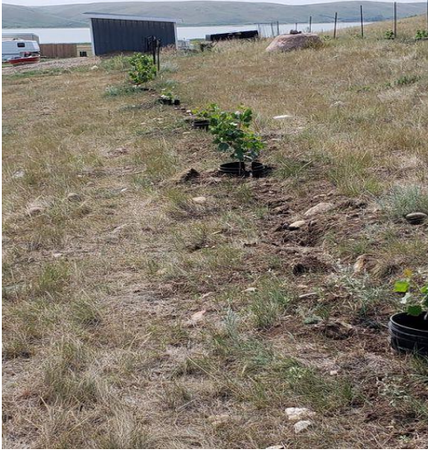
Prairie Sky Poplar in July 2021 distributed through Tree for Life planted along Duncairn Reservoir

This past year, the SCCWS and other Watershed Stewardship Groups in Saskatchewan combined to distribute 27,000 trees through out the province to be planted to sequester carbon to mitigate impacts of climate change. The SCCWS distributed 3,000 trees to watershed residents, the response was overwhelming, and we could have given away many more trees if we had the supplies.